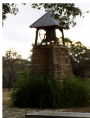
Bell Tower at Camp Capers